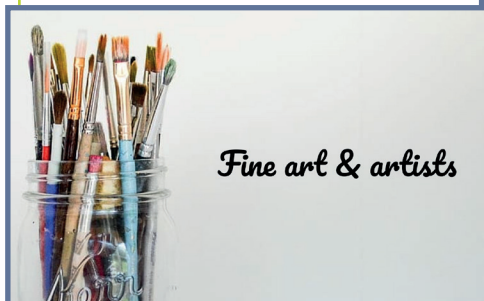
Fine art & artists