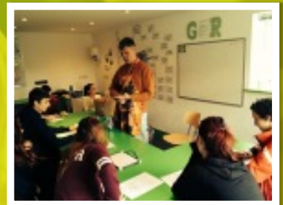
SCIENCE WITH SYD