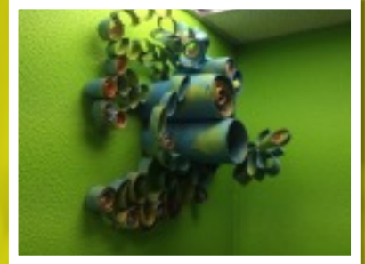
3D WALL ART